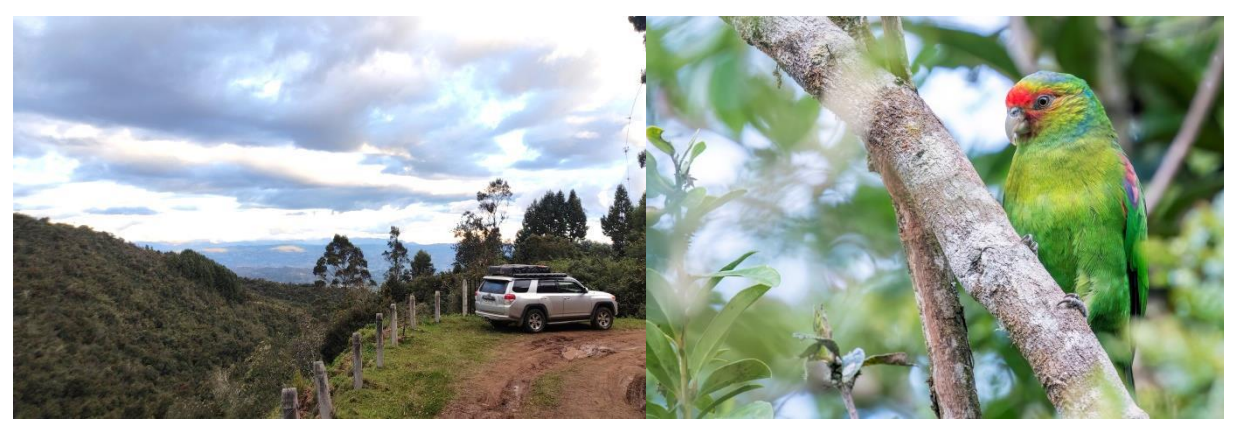
View at Camino al Cielo

found this habitat less attractive and less suitable for most birds. We still had a fly-by of 2 Red-faced Parrots.