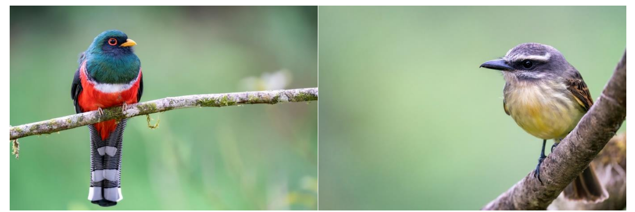
Masked Trogon male

At 07.30 the White-bellied Antpitta is fed at the beginning of the Tapir Trail. Unfortunately it was very dark, with lots of vegetation above it. Taking pictures was incredibly difficult (I asked them to remove some of the huge leaves blocking most of the light for the next photographers, so you might want to check the feeder already the afternoon before). A pair of Rufous-crowned Tody-flycatchers was present in the bamboo below the feeders at the restaurant. A Black Agouti came up to the corn feeder.