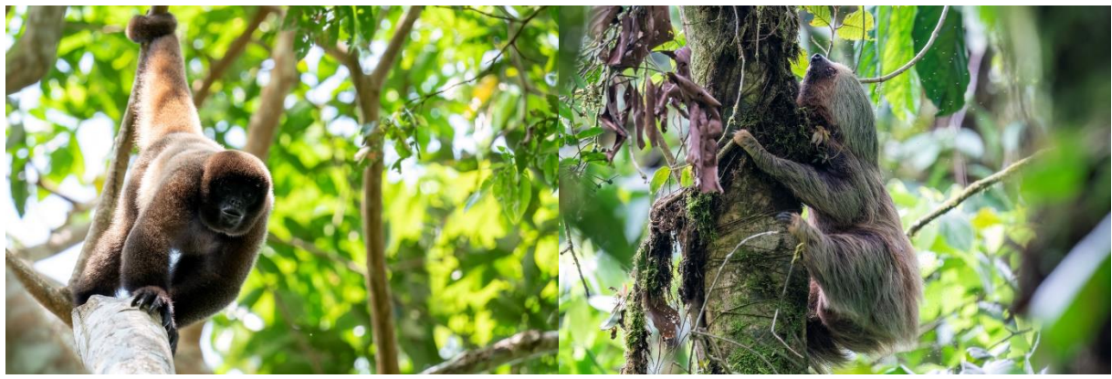
Common Woolly Monkey

If you like my pictures, you are in luck: they are for sale! For publication, presswork or just as artwork in your office or at home. A great memory of those great species you've seen during that trip! We donate 10% of our profits to WWF. My photos can be used for free for conservation or educational purposes after consultation. Have a look on my website and/or contact us via the website for the possibilities if you are interested: <u>www.robjansenphotography.com/shop</u>