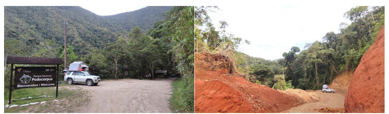
Our loyal friend Forrest at Podocarpus NP

Our transportation in Ecuador was of course our Toyota 4Runner SR5 4.0 2010 (2WD) called 'Forrest'. We bought this car in Santiago (Chile) and got it converted so that we could sleep in it as well. Our 2WD did well in Ecuador and we barely had any problems on the road. Roads are generally really good, even the gravel ones. After the main roads in Colombia and eastern Brazil, these might have been the best roads we came across in the whole of South America. There are of course always a few exceptions where we needed high clearance/good shock absorbers. At locations where this is the case we mentioned it in the text. Generally a simple sedan (2WD) will do really well in Ecuador, and there is no need to hire an expensive car.