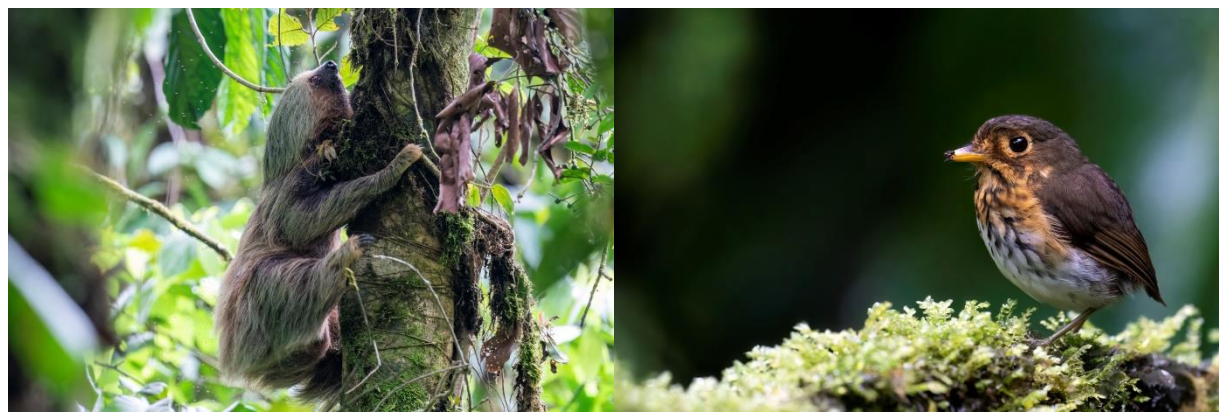
Linnaeus's Two-toed Sloth

The next couple of 100 meters were full of new species, including Spot-backed Antbird , Rufous-tailed Foliage-gleaner (which was observed multiple times that day) and the best ones: Grey-tailed Piha , Yellow-throated Spadebill (-0.6869, -77.5994) and Chestnut-crowned Gnateater (-0.6873, -77.5991). Along this first part is where Byron has observed Black Tinamou and Sapphire Quail-dove , but we failed to hear or see them.