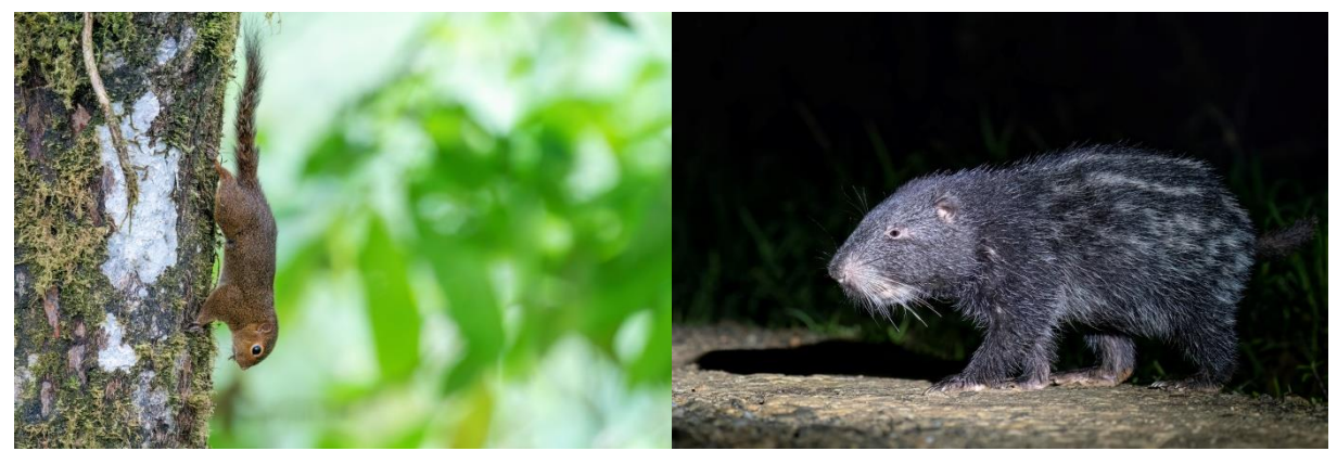
Western Dwarf Squirrel