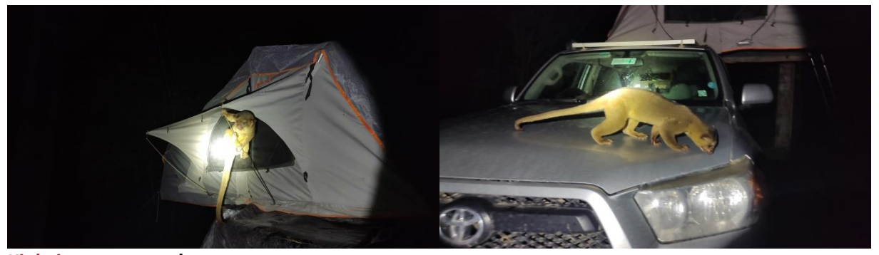
Kinkajou on our car!

The first 2 nights we did night walks along the main road, but spotlighting didn't yield much. We once saw a dark Opossum crossing the road, with another quickly going back into the shrubs. From what we saw it must have been an Andean White-eared Opossum . Another time we saw eyeshine, but couldn't make out what it was. A Common Tapeti hopped off to the side of the road on the second night. The last night we were too tired from all the walking to go spotlighting. Then nature decided they would send someone over. Around 21.30 we suddenly heard a loud smack against our roof top tent. I turned around and asked what Romy was doing. It turned out it wasn't Romy, but a Kinkajou ! Walking on our roof, awning, climbing up the tent etc. Rob got out to get better looks, but the Kinkajou was not scared at all. In contrary, it followed him across the parking lot. After a few rounds of chasing him, Rob quickly climbed up the ladder into the tent. Romy closed the zipper, just in time, as the Kinkajou had made it up the stairs as well. A crazy night this was!