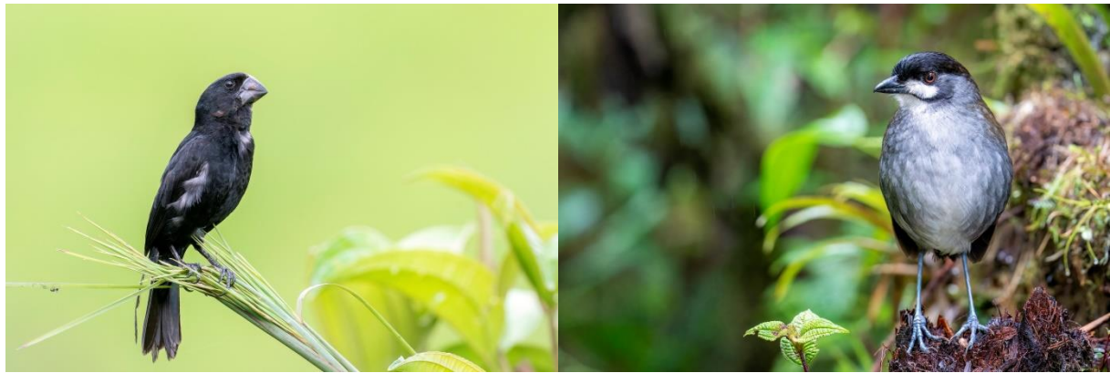
Black-billed Seed Finch