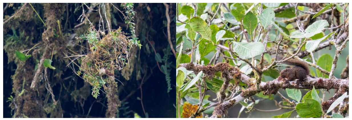
Spectacled Prickletail at its nest

We drove through Paquisha and followed maps.me up the road towards our camping spot (-3.91876, -78.614432) around 1820m. By driving there you will pass one cattle gate, which you can open and close (it's meant to keep cattle in, not people out). The habitat below the gate is already interesting, and there we found Lemon-browed Flycatchers . The main target for us was the Prickletail, which can be seen in mixed flocks. We walked the road 2 mornings and 2 afternoons; 2 afternoons until the top (around 1870m) and two mornings until the end of the road (currently at <u>-3.926438</u>, <u>-78.606676</u> at 1750m). White-bellied Antpitta and Long-tailed Tapaculo were heard often in the early mornings. We heard Black-chested Fruiteater quite often and managed to see it once (mostly around <u>-3.9209</u>, <u>-78.6128</u>). Mixed flocks had quite some species in them, amongst which Flammulated Treehunter, Ash-browed Spinetail, Rufous-crested Tanager and Pale-edged Flycatcher</u>, but no Prickletails. Other good birds we encountered along the road while searching for flocks were Chestnut-bellied Thrush, Yellow-vented Woodpecker and Tawny-breasted Hermit. We also observed quite a fair amount of Amazon Dwarf Squirrels, which were a real treat!