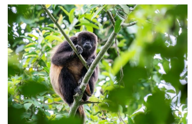
Ecuadorian Mantled Howler