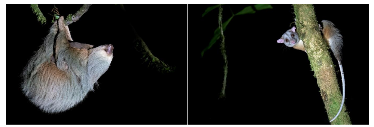
Hoffmann's Two-toed Sloth

We spotlighted the trail starting at the tower and ending at the ranger station (and then back to the tower), and it took about 2-2.5h to spotlight it with flashlights and thermal camera. We started by playing the tape of the Berlepsch's Tinamou , which is often seen around the tower. The rangers try to lure it with corn, but they didn't put anything out there that night. As the trail is quite broad and so well maintained, it's really good for spotlighting. A couple of 100m into the trail Romy observed a big white blob in the Lahoux Spotter Elite 35V thermal camera, and this turned out to be an Ecuadorian Mantled Howler sleeping alone on a branch. Halfway in we found Central American Woolly Opossum/Derby's Woolly Opossum . That one was barely gone when Romy noticed another long shape on a horizontal branch. These turned out to be 5 Rufous-fronted Wood-quails sleeping 20m high up in a tree. Right after Romy again spotted something; this time Hoffmann's Two-toed Sloth hanging from a vine, with a baby on the belly. On two different locations we found a total of 3 Kinkajous. Almost near the ranger station something jumped away on the right side of the path, and Romy could just make out the shape of an Armadillo spec . in the thermal camera. Unfortunately we couldn't find it anymore, but there were lots of digging traces around. Around the ranger station we found Common Potoo hawking for insects.