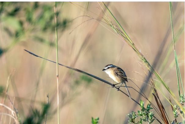
Sharp-tailed Grass Tyrant