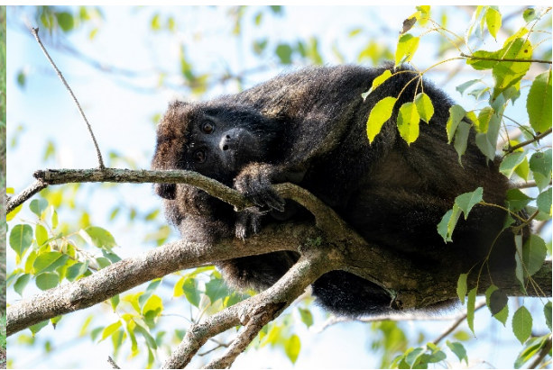
Paraguayan Howler male