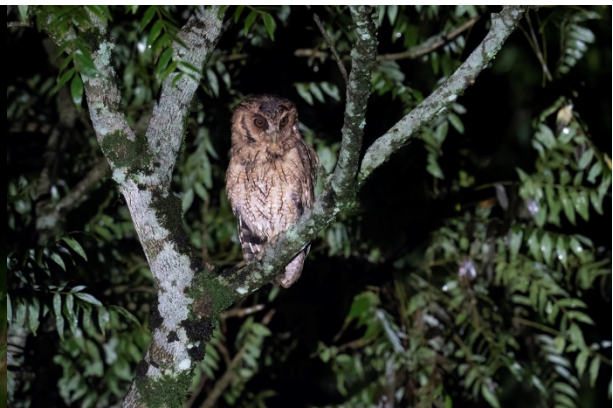
Long-tufted Screech Owl