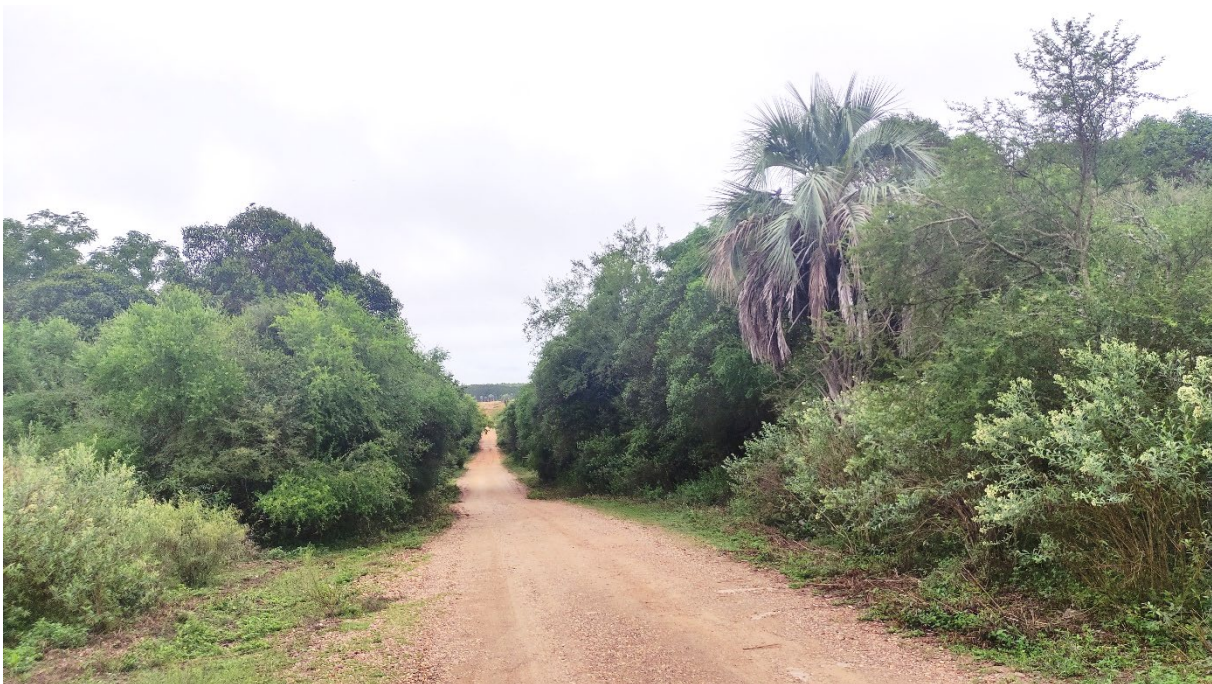
Arroyo los Loros (if you look very closely, you can't see the Geoffroy's Cat either)

Most of the second day rain came pouring down. At 17.00 it cleared up a bit and we staked out till 20.00 on the bridge at Arroyo los Loros (which was officially already closed off because of the rain). I saw a Lesser Grison crossing the road after the bridge for a split second, Romy missed it. Further up the hill an Armadillo spec. quickly crossed the road. No cats. We spotlighted the main road from 20.00-22.30, being careful for oncoming cars as spotlighting is forbidden. We also went into the Arroyo los Loros and the Ruinas Históricas once. We saw 3 Nine-banded Armadillos , 13 Crab-eating Foxes and 1 introduced European Hare . Back at the campgrounds 2 Great Horned Owls were calling from a tree in front of the restaurant and two Tropical Screech Owls at the back of the camping.