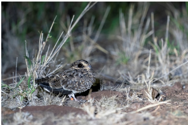
Sickle-winged Nightjar male

The next morning we walked the main road again for a couple of 100 meters for our second target here: Sharp-tailed Tyrant . Very soon we had 5 individuals in the high grass. An amazing species!