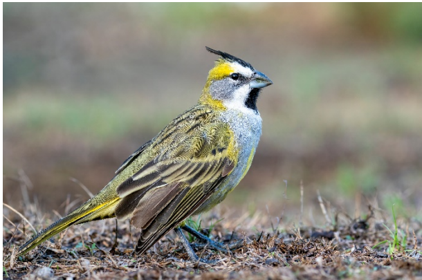
Yellow Cardinal female

There are a few spots east of town that are good for Yellow Cardinal . As this location is on private land you will need to ask permission before entering, although it might be possible to spot the target from the road. As we got this location from a guide and this bird species is endangered because of trade, we won't reveal the location here. Feel free to contact me. You can also hire Roque Hernán Bocalandro as a guide. He speaks just a little English, but he is enthusiastic and knows his birds. His numbers for WhatsApp is +54 9 3773 62-8797, or you can find him at his place ( -28.53613, -57.17336 ).