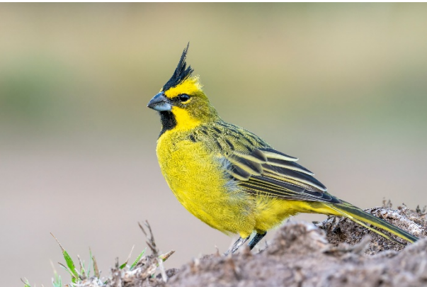
Yellow Cardinal male