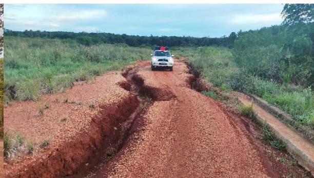
Forrest on the road at Calendaría