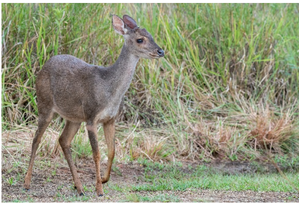
Brown Brocket Deer

Provincial Park Iberá is located just south of the bridge. The entrance fee is a one-time 2500 ARS p.p. (24USD). Quite steep for the amount of trails you can walk, especially because the National Park a bit further south is free. However, you also need to pay this entrance fee if you are to do a boat tour on the lake, so better walk the trails as well then. Bring a scope for the trails north of the road (Sendero de los Montes) if the water levels are low, because most water birds were quite far away. We did have a great male Marsh Deer and multiple Brown Brocket Deer (including a pair with a spotted young). Crested Doradito should be possible on the boardwalk when the water is higher (beginning of the northern trails). On the south side of the road is another short trail (Sendero Caraya). Here you can find Paraguayan Howlers . We encountered a group of 1 male and 3 females and also heard them from Ruta 40 early morning. It should be possible to find them in the National Park as well.