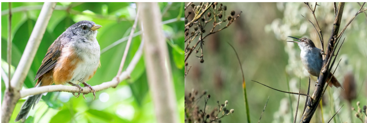
Gray-throated Warbling Finch

Afterwards we birded the road on the other side of the railway. This is a public road, and also accessible outside of the reserve hours. The road was quite busy when we were there, lots of noisy cars passing and dust flying around because of that. The main targets here are Straight-billed Reedhaunter and Curve-billed Reedhaunter . The latter was found quite easily on the first 100m after the curve (from here: -34.22087, -58.89574 ). This part of the road has nice sedge and reed on both sides. Further north the road has trees and bushes on the east side of the road, but still good marshy habitat on the west side. We got warned by a man passing by that we might get robbed walking there with our camera and binos by the people living along the railway. This made the birding obviously less pleasant. We decided to drive, park, bird 50m towards the south and north, drive again 100m and repeat. We covered quite some distance and found Sulphur-bearded Reedhaunter , Curve-billed Reedhaunter , Spix's Spinetail and some more common bird species. Brazilian Guinea Pig crossed the road several times, especially late afternoon and early morning. It was when we were about to give up and walked back to our car that we suddenly got 2 Straight-billed Reedhaunters right next to our car (where we tried earlier that morning and the day before!). Not the most exciting place to bird, but some good species. Ash-throated Cuckoo is found here as well by others.