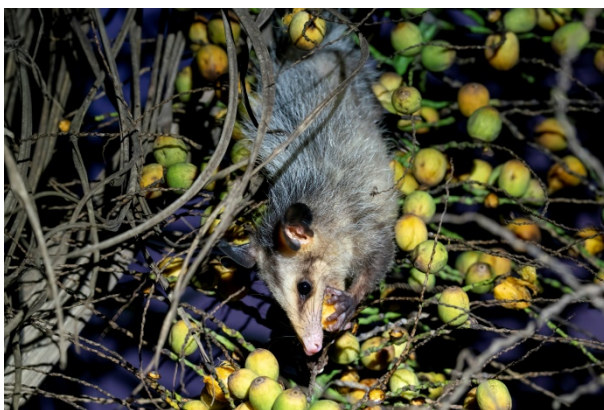
Southern Black-eared Opossum

There are two trails here, but we got hopelessly lost already on the first afternoon as the signage is not good (read: as good as absent). The trail south of the camping area goes through some open pine forest and later shrubs and bamboo. Yellow-fronted Woodpecker was quite common on the trails, as was Surucua Trogon . A nice addition to the more common species in the flocks so far was a Blackish-blue Seedeater with its very broad beak. The best bird was a very obliging Swallow-tailed Manakin .