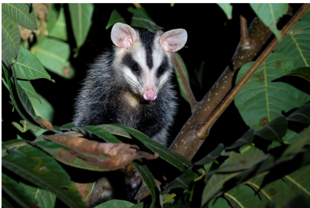
Brazilian White-eared Opossum

A Stygian Owl is sometimes heard and seen at the Camping Der Wald ( -26.61009, -54.09942 ). Unfortunately we didn't hear or see any owls there. We did see a Brazilian White-eared Opossum .