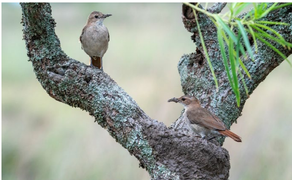
Rufous Horneros building their famous nest

There are a few places of interest east of the town Colonia Carlos Pellegrini. A short road towards the north leads towards an observation tower ( -28.52919, -57.1576 ), from which Streamer-tailed Tyrant should be reliably seen normally. Due to the fires the habitat was destroyed and we didn't see it. Another road leads towards the south ( -28.54738, -57.15897 ). Only drive this when it's dry. Here we found a pair of Black-and-white Monjita . Seedeaters are seen here as well, but we didn't find any. We did see Brazilian Guinea Pig here.