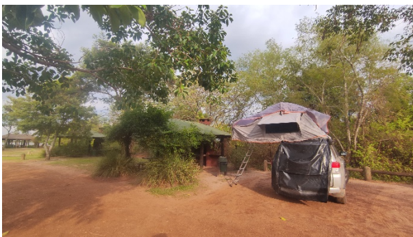
Our loyal friend Forrest at NP Iberá

Our transportation in this trip report was of course our Toyota 4Runner SR5 4.0 2010 (2x4) called 'Forrest'. We bought this car in Santiago and got it converted so that we could sleep in it as well. A car with high clearance isn't needed per se in the northeast region of Argentina, but we would recommend it. There are lots of gravel roads which we took with great ease. These are doable with a normal sedan, but require more care. Rain made lots of roads impassable though, as the ground turned into mud and a slippery clayish layer formed (the 101 near Iguazú for example). We had to wait out a 1-2 days to make sure the roads were driveable (to and from Iberá NP and at Caa Yari).