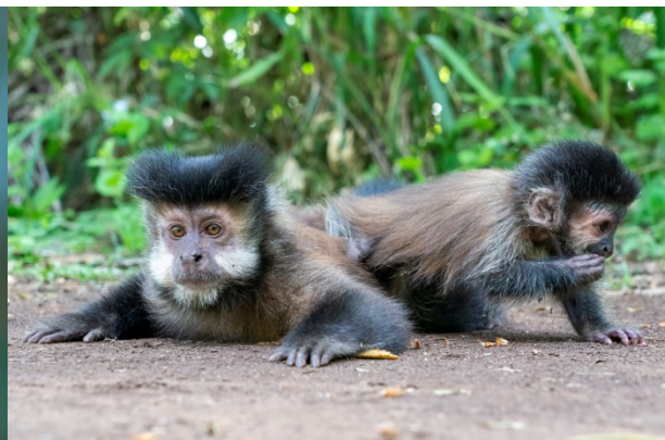
Black Capuchin / Black-horned Capuchin