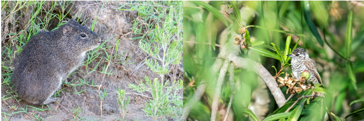
Brazilian Guinea Pig

side of the road was gone. We did find Tawny-bellied Seedeater and Rufous-rumped Seedeater just before the gate of the estancia, and (too) shortly something that looked like a Bearded Tachuri from a distance. We only observed more common species like Rufous-capped Antshrike and the super tiny White-barred Piculet . Not worth the detour in our opinion on a (short) holiday.